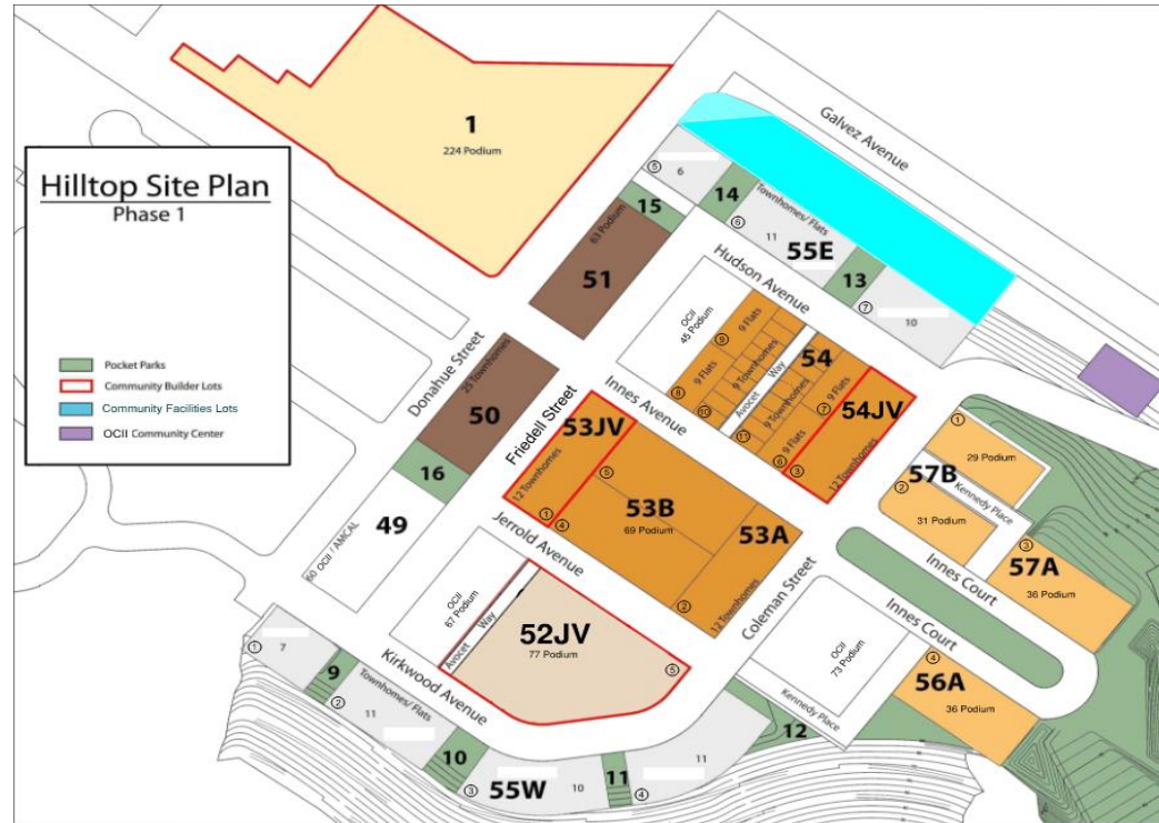
The San Francisco Shipyard - Phase 1

Update: Lennar to fund horizontal infrastructure to support these parcels. OCII, CAC and Developer will need collaborate on a plan for future use of these parcels.